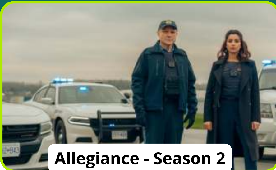
Allegiance - Season 2