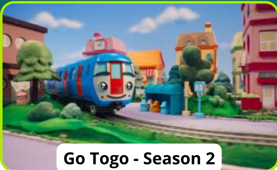
Go Togo - Season 2