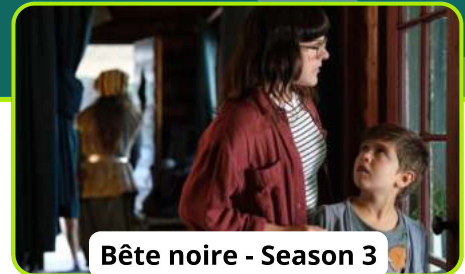
Bête noire - Season 3

Justine Gamache returns to Port-Menier, Anticosti's only village, for the first time in seven years following the success of her novel. Her arrival coincides with tensions surrounding a hotel project in the middle of the forest. But everything changes when Sophie Pelletier is found dead at the foot of the Vauréal Waterfall. The police conclude that it was suicide, but the islanders disagree. Justine joins forces with the gamekeeper Michael Mackenzie to uncover the truth.