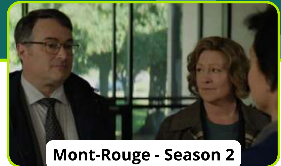
Mont-Rouge - Season 2

Beneath his 16-year-old exterior, Liam is a humanoid engineered in secret at the Global Artificial Intelligence Laboratory. Having developed his own will and emotions, he refuses his mission to enslave mankind. Hunted by his creator, Dr. Wood, Liam must flee before an attack planned for the Universal Science Fair. Helped by Rafaële and a group of teenagers, he must escape from Dr. Wood, foil his plot, and unlock the secret of Belmont Forest.