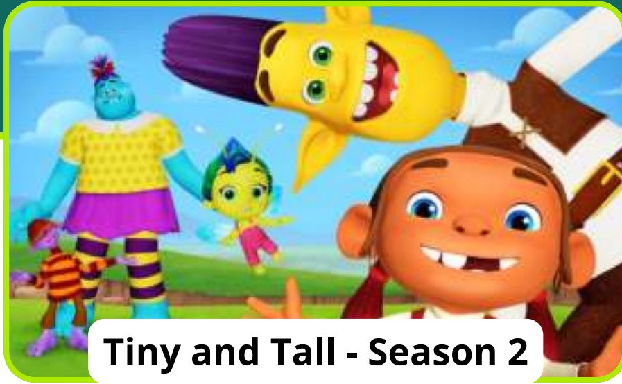
Tiny and Tall - Season 2